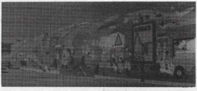
The mural as it is today, the undercoat only.

To teachers and staff at CPAS who put time and effort into organising Come-Out.