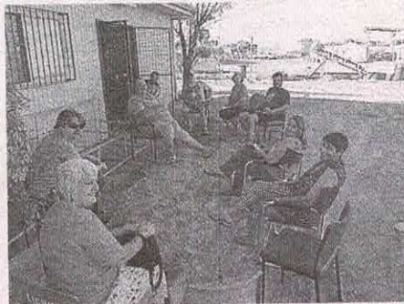
Committee members and volunteers at the Driveln when the new digital equipment arrived