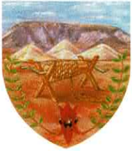
COOBER PEDY DISTRICT COUNCIL