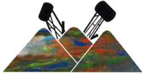
COOBER PEDY RETAIL, BUSINESS AND TOURISM ASSOCIATION