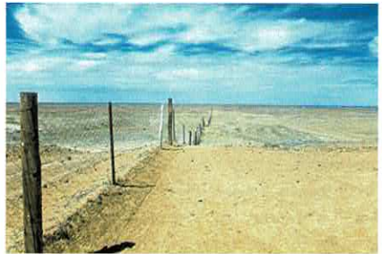
The Dingo Fence