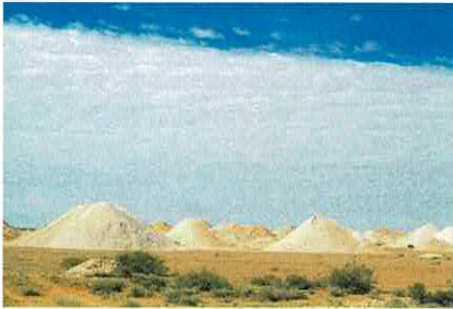
The Lunar Landscape