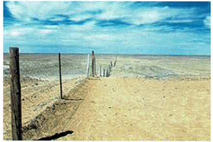
The Dingo Fence