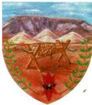
COOBER PEDY DISTRICT COUNCIL