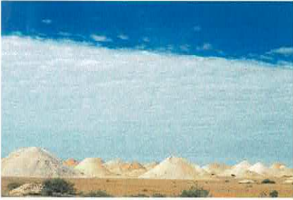
The Lunar Landscape