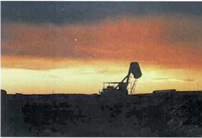
An Outback Sunset