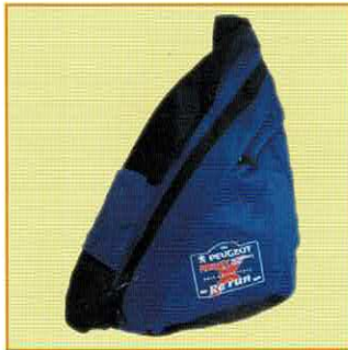
Peugeot Redex Blue Sling Backpack – RRP $35.00*