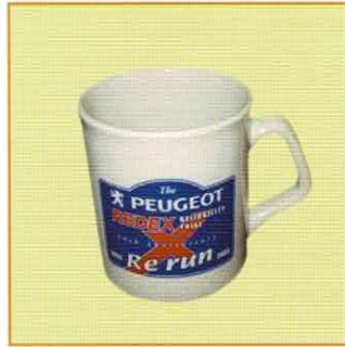
Peugeot Redex White Coffee Mug – RRP $12.00*