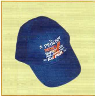
Peugeot Redex Blue Cap – RRP $16.00*