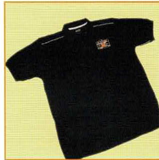
Peugeot Redex Navy Polo Shirt S to XL – RRP $40.00*