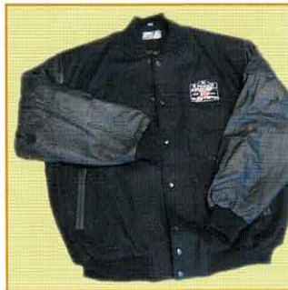
Peugeot Redex Navy Baseball Jacket wool/leather S to XL – RRP $160.00*