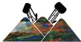
COOBER PEDY RETAIL, BUSINESS AND TOURISM ASSOCIATION