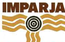
TELEVISION Rllerrke Alnyenelyeke Keeping Strong