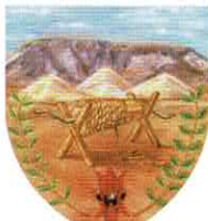
COOBER PEDY DISTRICT COUNCIL