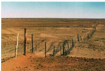
The Dingo Fence