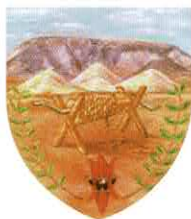
COOPER PEDY DISTRICT COUNCIL