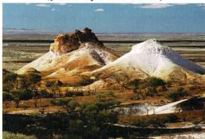
Breakaway Country