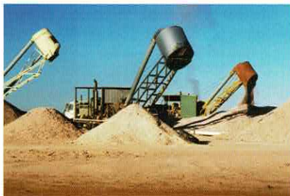
A Blower working on a Coober Pedy opal field

The Regional Arts Fund is an Australian Government initiative supporting the arts in regional and remote Australia