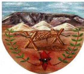
District Council of Coober Pedy