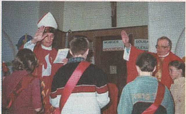
Bishop Hurley imparts a blessing to conclude the confirmation at Wilmington.