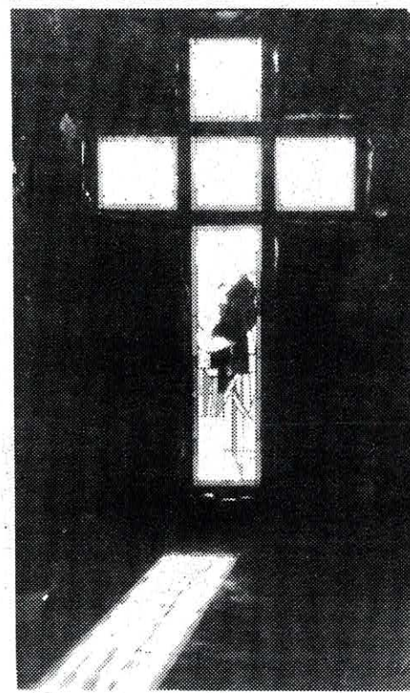
Afternoon light shines through the stained glass window.

St Vincent de Paul's The CLOTHES HORSE Open Wed. & Thurs. 11am — 3pm at TAFE