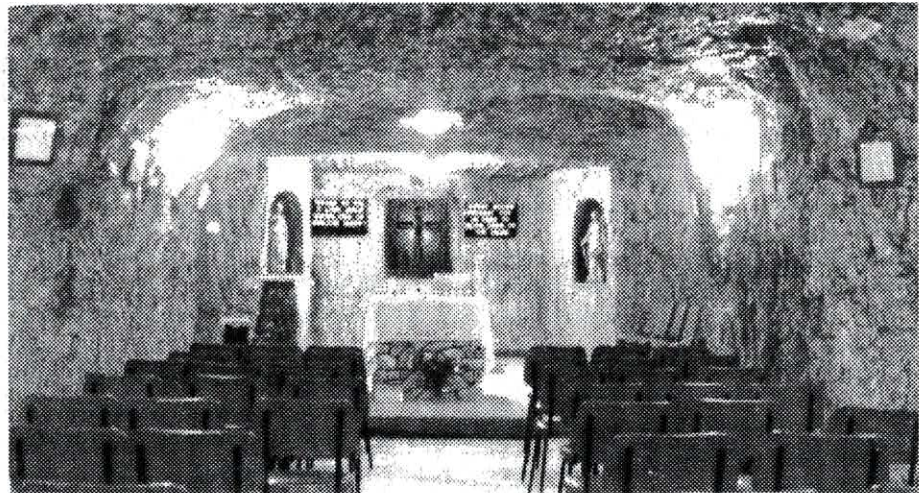
Looking to the altar, inside the church

Visitors to Coober Pedy's underground church will usually find the door open and are requested to respect the church when entering and leaving. Lights should be turned off and the door closed. The altar, made from local sandstone, features in the centre of the church, and the rough hewn walls have been coated with a clear bonding paint to show off the natural beauty of the ground. A couple of years ago the church underwent major extensions and a new verandah was installed at the front, a bell tower completed and a bell installed. Also the seating capacity of the church