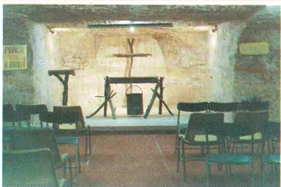
THE CATACOMB CHURCH Catacomb Road (behind Hospital Hill). P. O. Box 266, Coober Pedy, S.A. 5723 Telephone (086) 72 5038.

Holy Spirit, show me the forgiveness of all my sins. Fill me with love, with life, with Yourself.