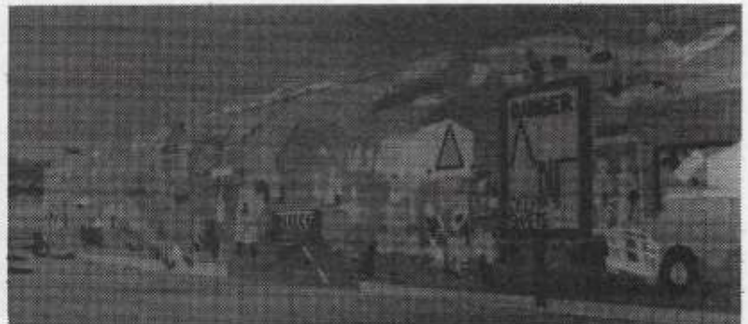
The mural as it is today, the undercoat only.

The Co-ordinating Committee urges all people interested, to go along and assist in the completion of the wall. Already it is a popular picture with visitors who photograph it although it is unfinished.