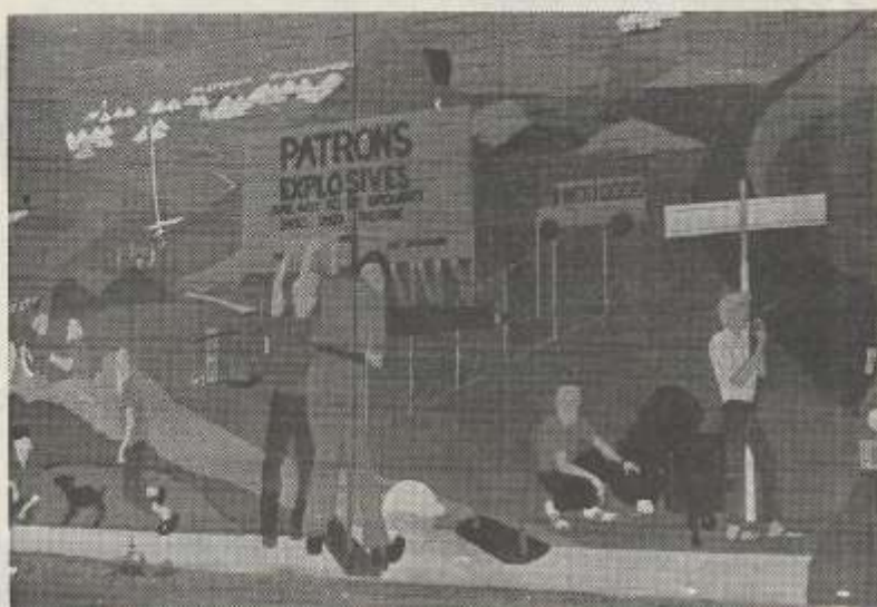
A section of the mural on Lucas' supermarket wall