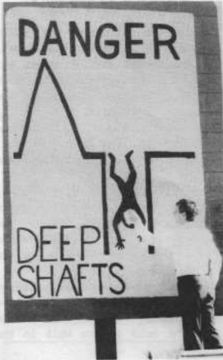
Premier Bannon, Minister for the Arts, adding his touch to the mural. page 4