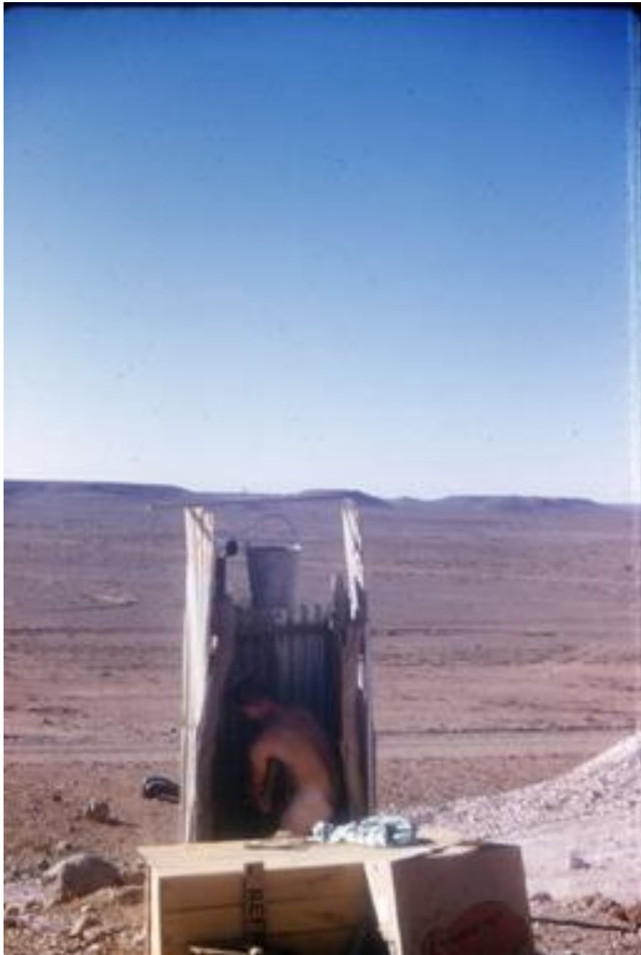
Sid Allen having a “bucket shower” 1961 NW Ridge is on the skyline